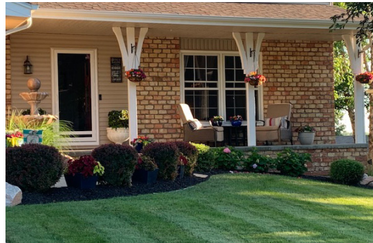
15015 Martha Circle