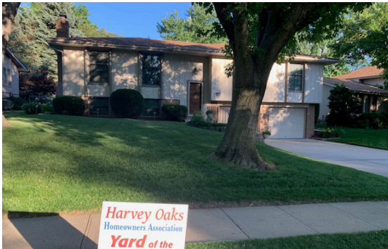
2415 S 148th Street